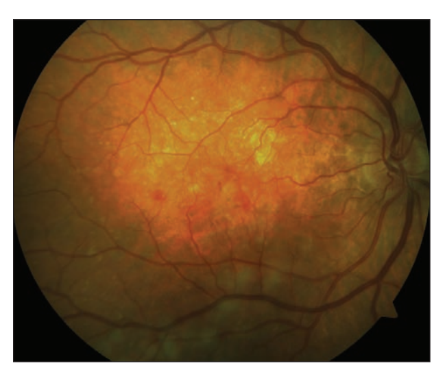
Figure 1. Fundus photograph showing atrophy.

Studies in a mouse model analyzing the role of VEGF in the RPE suggest that VEGF is an important neuroprotective protein that has a functional role in supporting adult subretinal vasculature, including the choriocapillaris.<sup>4</sup> The choriocapillaris, in turn, nurtures cones and photoreceptors and maintains central vision.